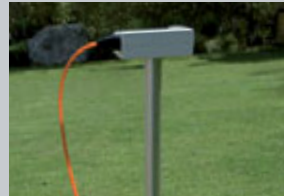
Sensing device and electronic housing