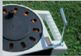
Mounted by means of earth spike